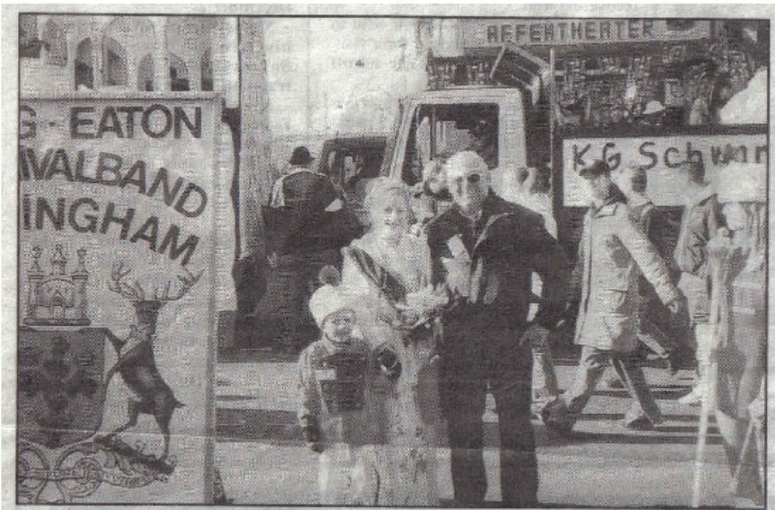
Above: Long Eaton Militaires Carnival band members.