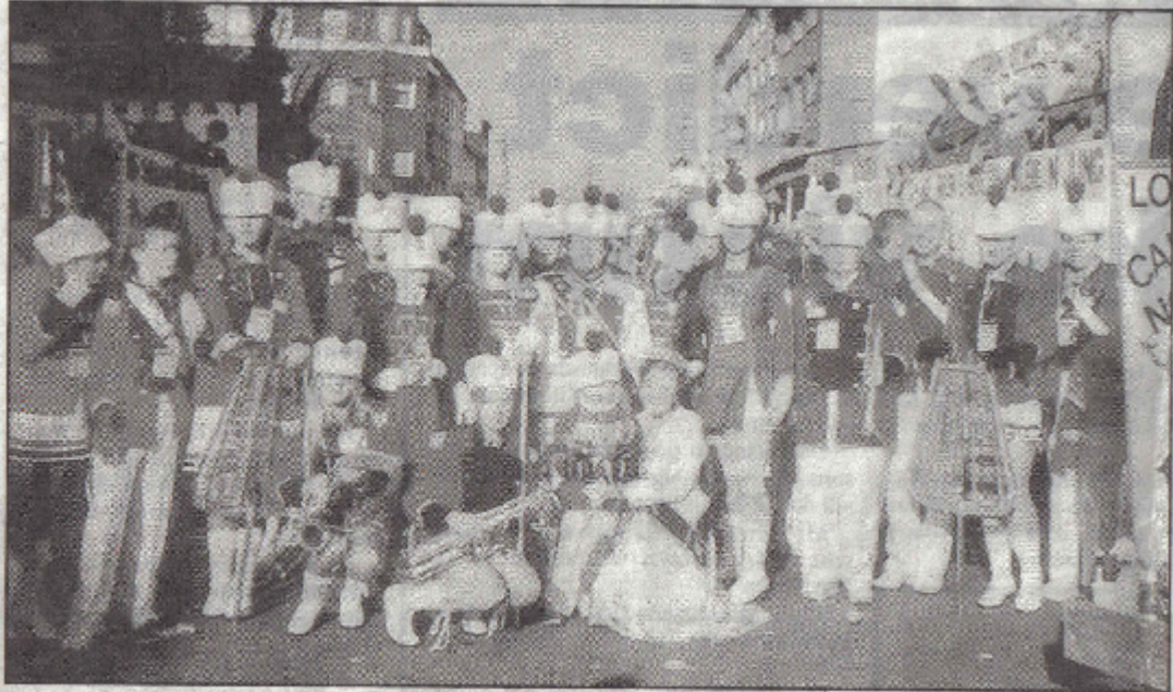
Above: The parade passes through Oberhausen on Sunday morning. Long Eaton Carnival band group together. CNF