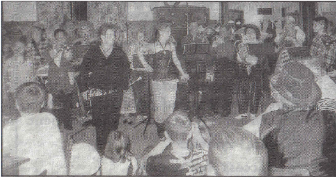
Above: Party night: Band members and others played during the night. CNF