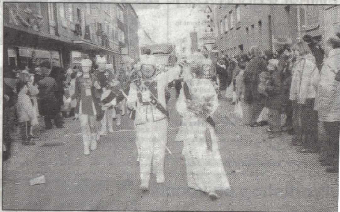
Above: Oberhausen during the parade. CNF